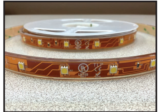
Polymer encased for IP65 applications.