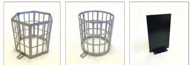
HEX and ROUND Wire Guards.